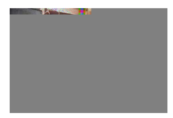
Figure E. Image of the Woodchip Boiler in the Heating Plant Facility. 2014.

In the wake of the energy crisis of 1979 and resulting financial concerns, The Board of Trustees approved the woodchip burning project on May 16th, 1981. As of September 15th, 1981, ground had been broken behind the existing heating plant for the construction of the new woodchip boiler facility (Colgate Maroon News, 1981, p.7). The total cost of this project with purchase and installation was approximately $840,000. Colgate received a federal grant in the amount of $480,000 and needed to pay the remaining balance (Colgate University, 1981). The cost of this project was offset by the savings that would accompany the